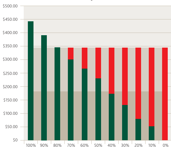
No Safety Net